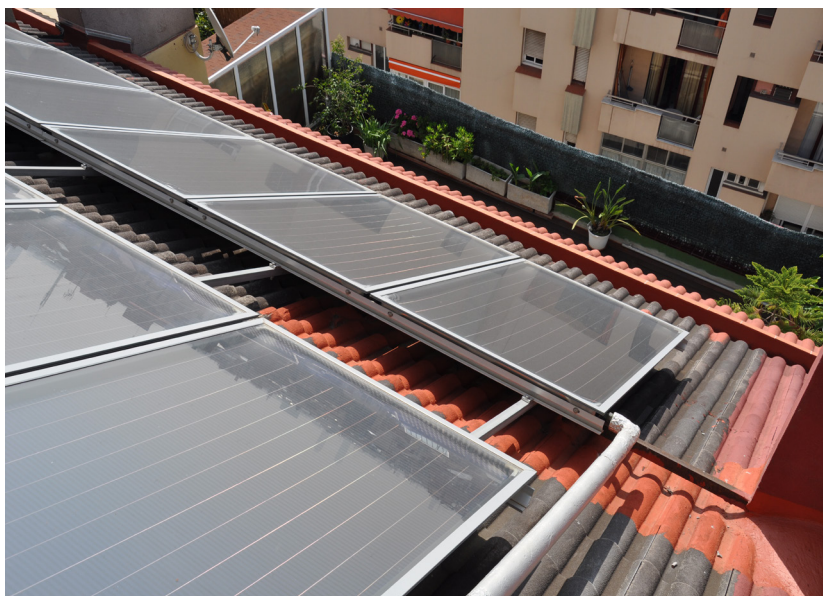
Tax incentives are provided for voluntary solar installations on private housing.