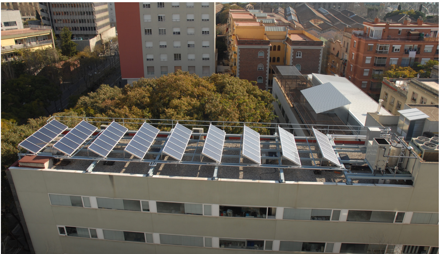
Local government leading the way: a solar energy installation at the Public Health Agency Laboratory

The Barcelona City Council has taken decisive actions to enhance the use of renewable energy in its community, including the use of solar thermal energy for water heating. The local government has set the example, installing systems in its own buildings and facilities, but also using its regulatory powers to require the use of solar energy in privately owned buildings. The Council took an integrated approach to overcome existing barriers. A range of complementary actions were taken, including stakeholder engagement, capacity building, information campaigns, and fiscal incentives.